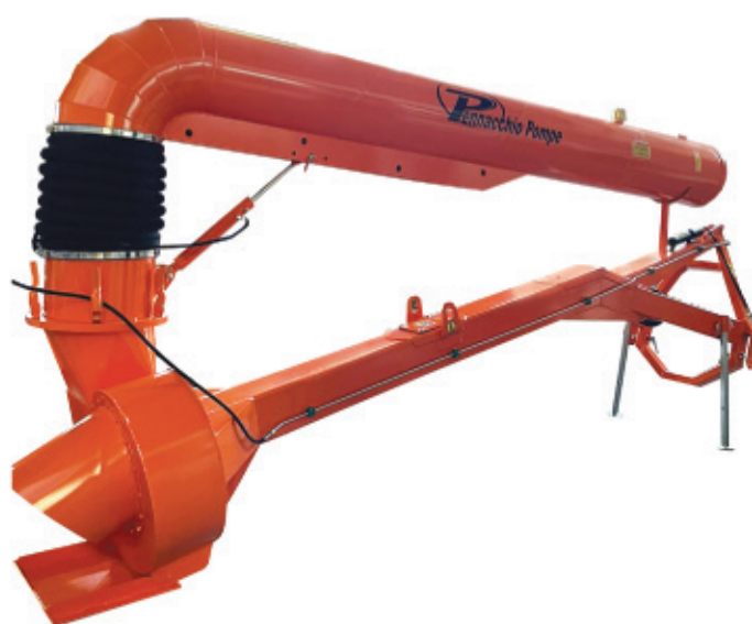
Manual pump with piston TP series

Oil bath transmission can be installed upon request