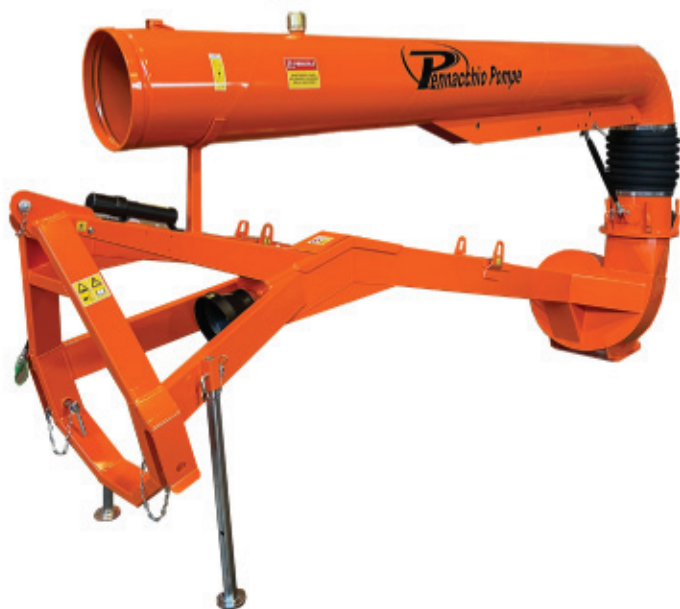
Manual pump TP series